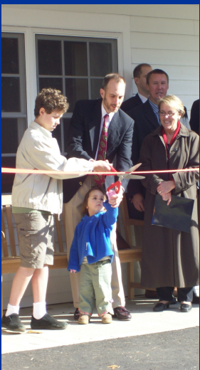
Ribbon Cutting Ceremony for New Elementary Building in Fall '09 with youngest and oldest student at DMS.